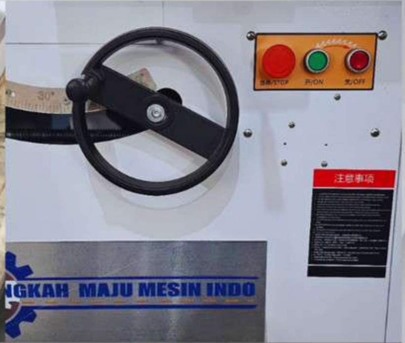
Flexible angle adjustment and smooth rotation