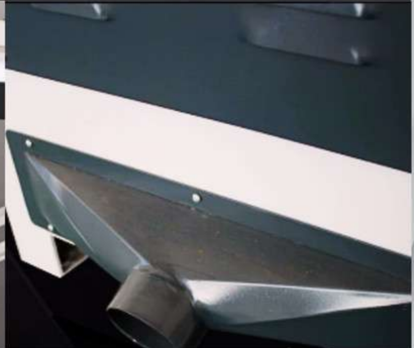
Lower vacuum port External vacuum cleaner