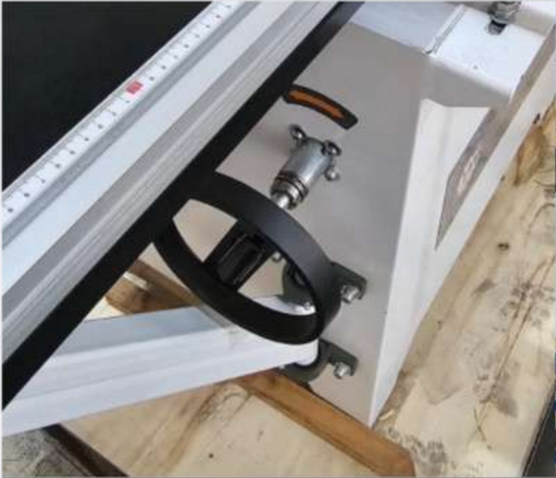
Flexible angle adjustment and smooth rotation