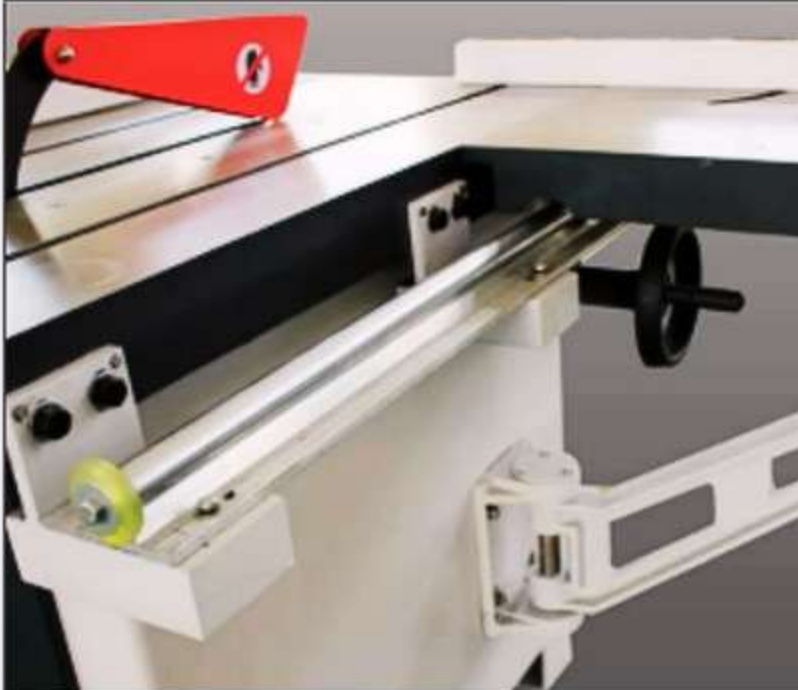
Smooth guide rails and slides make cutting operation easier