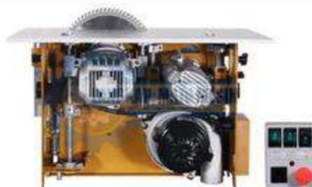
Dust-Free Saw Brush Parameter Table