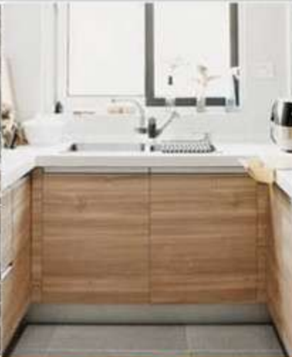
Kitchen Cabinet Processing