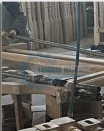
Furniture Edge Banding Factory