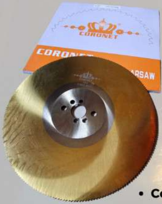
• Coronet HSS Circular Saw