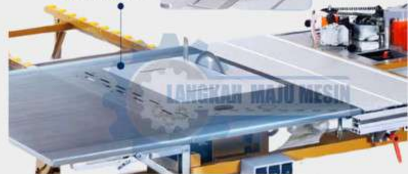
LANGKAH MAJU MESIN