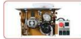
Brush table saw