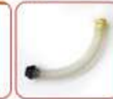
Dust collecting pipe