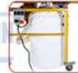
Dust collecting bag