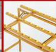
Moveable Fluent Bar